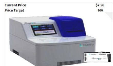
The Symphony System

Risks to our thesis include: 1. Regulatory Approvals; 2. Clinical Science 3. Dependence on OEM suppliers; 4. Development of the target markets 5. Intellectual Capital 6. Dilution.