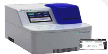
The Symphony System