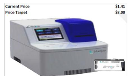
The Symphony System

Risks to our thesis include: 1. Regulatory Approvals; 2. Clinical Science 3. Dependence on OEM suppliers; 4. Development of the target markets 5. Intellectual Capital 6. Dilution.