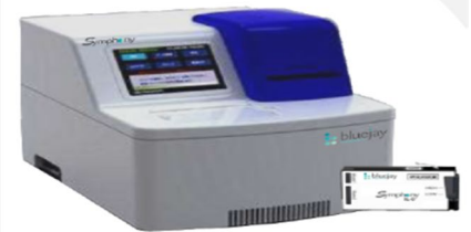
The Symphony System