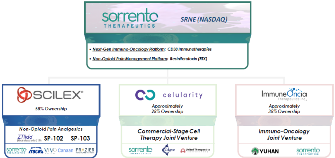
Exhibit 2. Corporate Structure